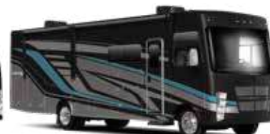
Full Body Paint – Night Quartz