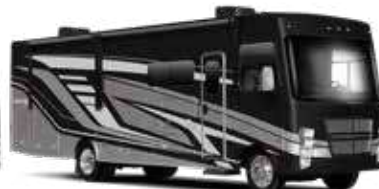
Full Body Paint – Midnight Platinum