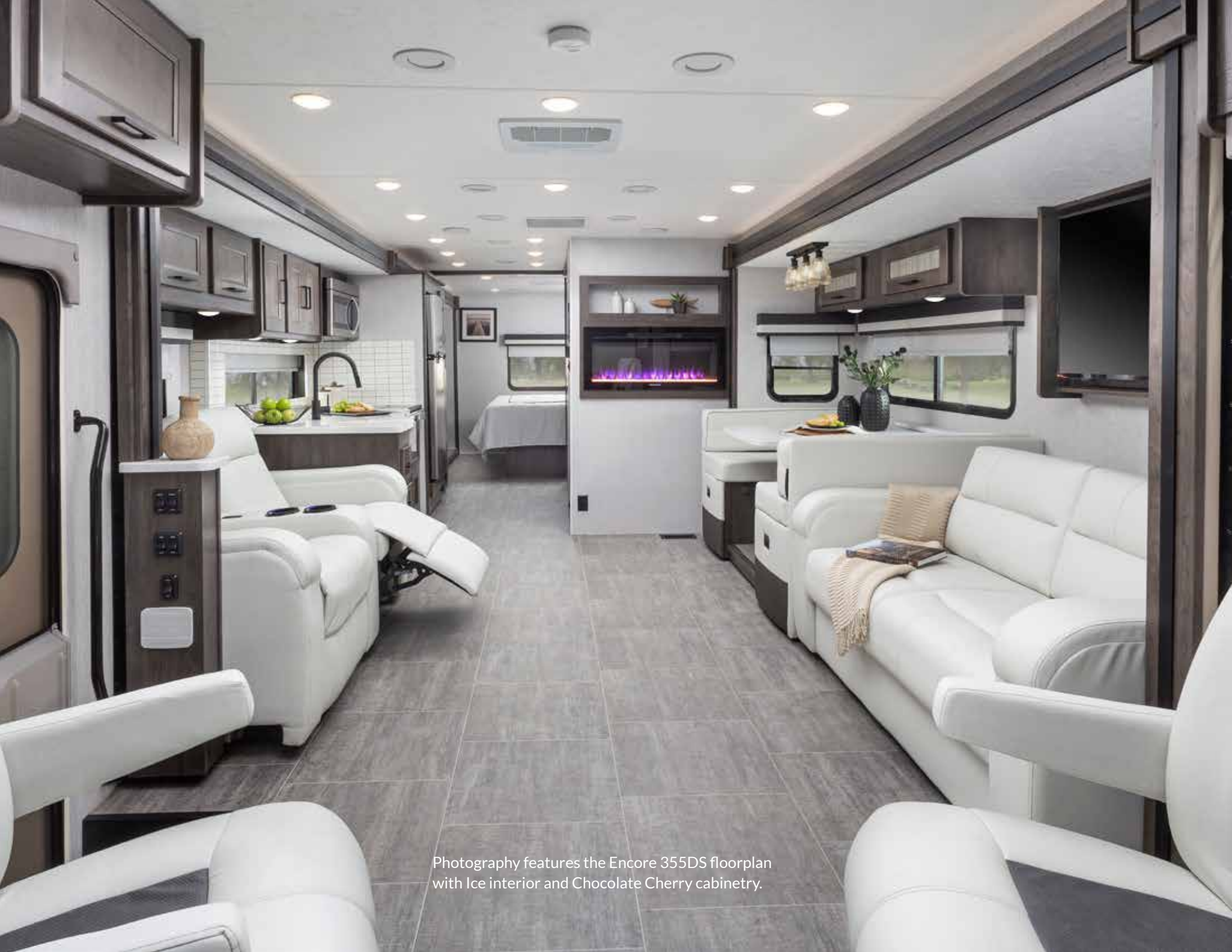
Photography features the Encore 355DS floorplan with Ice interior and Chocolate Cherry cabinetry.