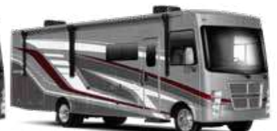
Full Body Paint – Starlight Ruby