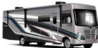
Full Body Paint – Coastal Iron